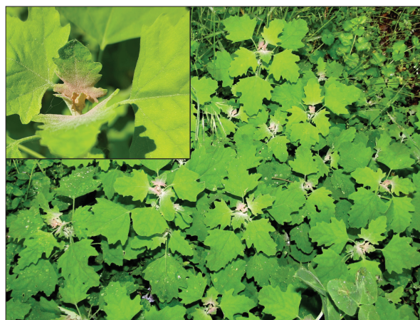
Fig. 2. Color features of young plants of Chenopodium ucrainicum . Stayky village, Obukhiv District, Kyiv Region, 27 May 2023. Close-up: Nyvky Park, Kyiv City, 30 May 2023

All known localities of C. ucrainicum outline the formed (secondary or primary?) geographic range of this species, which, as we know at present, consists of three fragments in the central and western parts of Ukraine (Fig. 3). Most of localities (about 82%) from Kyiv City, Cherkasy and Kyiv regions, and the adjacent territories of Vinnytsia and Zhytomyr regions, are concentrated in the central part of the Dnipro (Dnieper) Upland area. According to the physical and geographical zoning (physiographic regionalization) of Ukraine (Marynych et