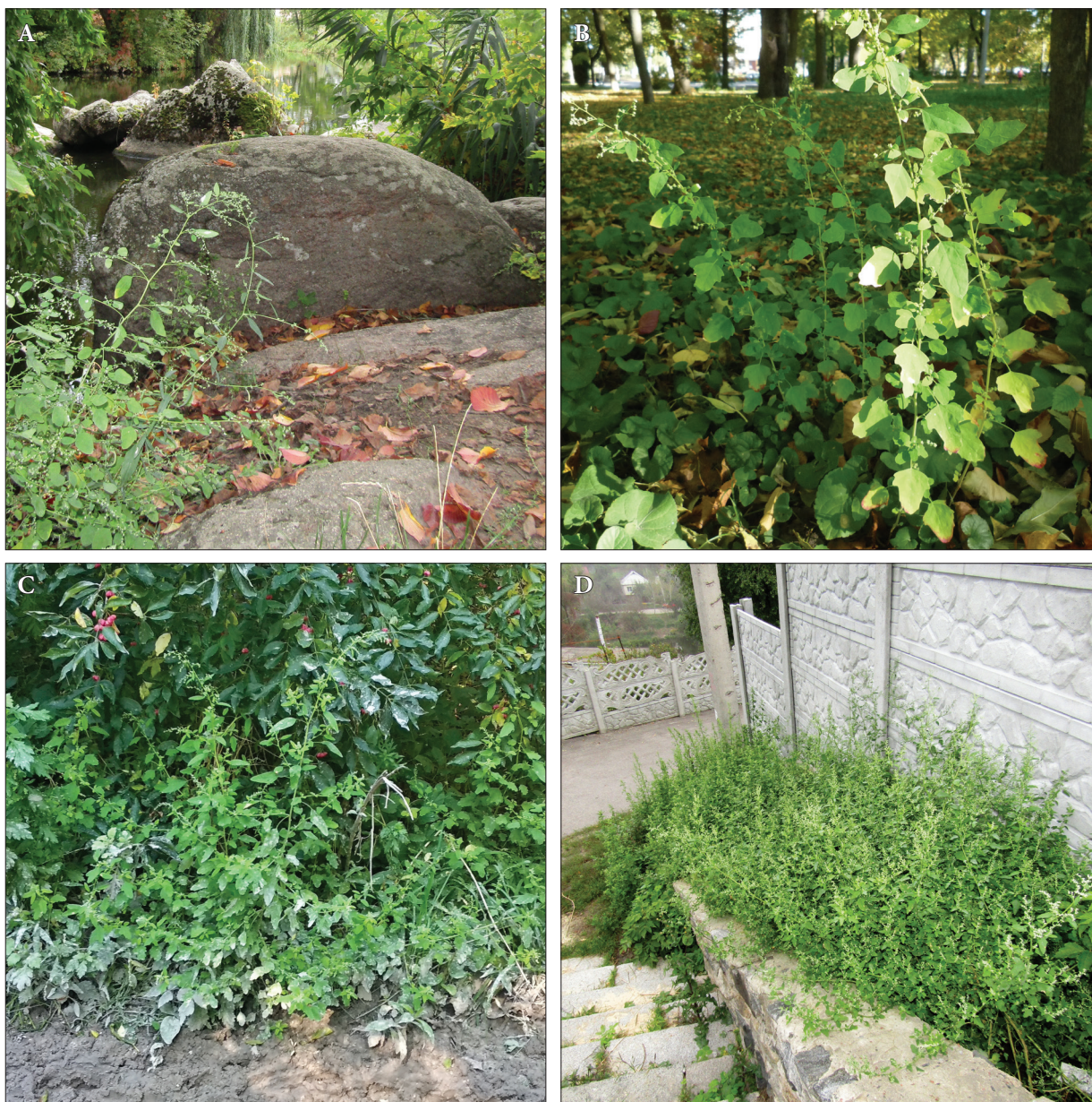
Fig. 4. Chenopodium ucrainicum habitats. A: stony banks of the Ros River, Bohuslav, Obukhiv District, Kyiv Region (photo by O. Shynder, 2021); B: shady park habitat, Stavyshe, Bila Tserkva District, Kyiv Region (photo by O. Shynder, 2021); C: forest road, outskirts of the Novomalyn, Rivne Region (photo by O. Holovko, 2021); D: abandoned flowerbed, Tarashcha, Bila Tserkva District, Kyiv Region (photo by O. Shynder, 2021)

Chenopodio ucrainicae-Aceretum negundi Pa-shkevych, ass. nov., hoc loco (alliance Balloto nigrae-Robinion pseudoacaciae Hadač et Sofron 1980; class Robinieta Jurko ex Hadač et Sofron 1980).