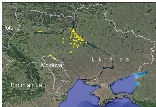
Fig. 3. The known range of Chenopodium ucrainicum ; for actual updates, see iNaturalist ( https://www.inaturalist.org/observations?taxon_id=1318362 ) and GBIF ( https://www.gbif.org/uk/species/11197744 )

al., 2003), this territory is located within the natural physiographic region of the Right Bank Forest-Steppe (where the first two words refer to the right bank of the Dnipro River, i.e., the areas west of the Dnipro), and only a few localities in Kyiv City are situated at the southern border of the Polissia (the Forest Zone) natural physiographic region. This “Dnipro” fragment of the known range of C. ucrainicum is the main one in terms of its area and number of localities. Here this species was collected for the first time in 1989 in Hrebinky, Bila Tserkva (formerly Vasylykiv) District of Kyiv Region, and here its locus classicus is located (Tatarka historical district, the northwestern part of Kyiv City).