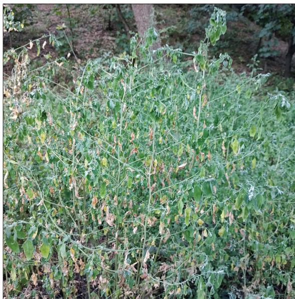
Fig. 5. Almost desiccated plants of Chenopodium ucrainicum at the end of the dry summer of 2024. Nyvky Park, Kyiv City, 30 August 2024

Most habitats of Chenopodium ucrainicum occur on sites with sufficiently humid and fertile soils. In the known range of C. ucrainicum , the most common soils are chernozems on the underlying loess layer, rarely on almost bare loess. The analysis of soil samples from a number of habitats (Supplement S3) proved that C. ucrainicum prefers rich soils with high humus content (5.2–14.5%) and moderately alkaline acidity (pH 7.18–7.58). The content of individual biogenic elements in the studied samples is within the limits of optimal indicators or even exceeds these limits. For example, for agricultural crops that are more demanding, the optimal indicators of the content of biogenic elements are as follows (in mg/l): \text{NH}_4 — 10–15, P — 110–130, K — 210–250, Ca — 3200–4000, Mg — 70–90, Fe — 50–80, S — 20–30, Mn — 15–20 (Zaimenko, 2021; Kushnir et al., 2023). In the studied habitats of C. ucrainicum , the content of such biogenic elements as \text{NH}_4 (20–50), P (54–437), Ca (6664–18992), S (37–50), Mn (15–25) at the end of the growing season exceeded the optimal indicators.