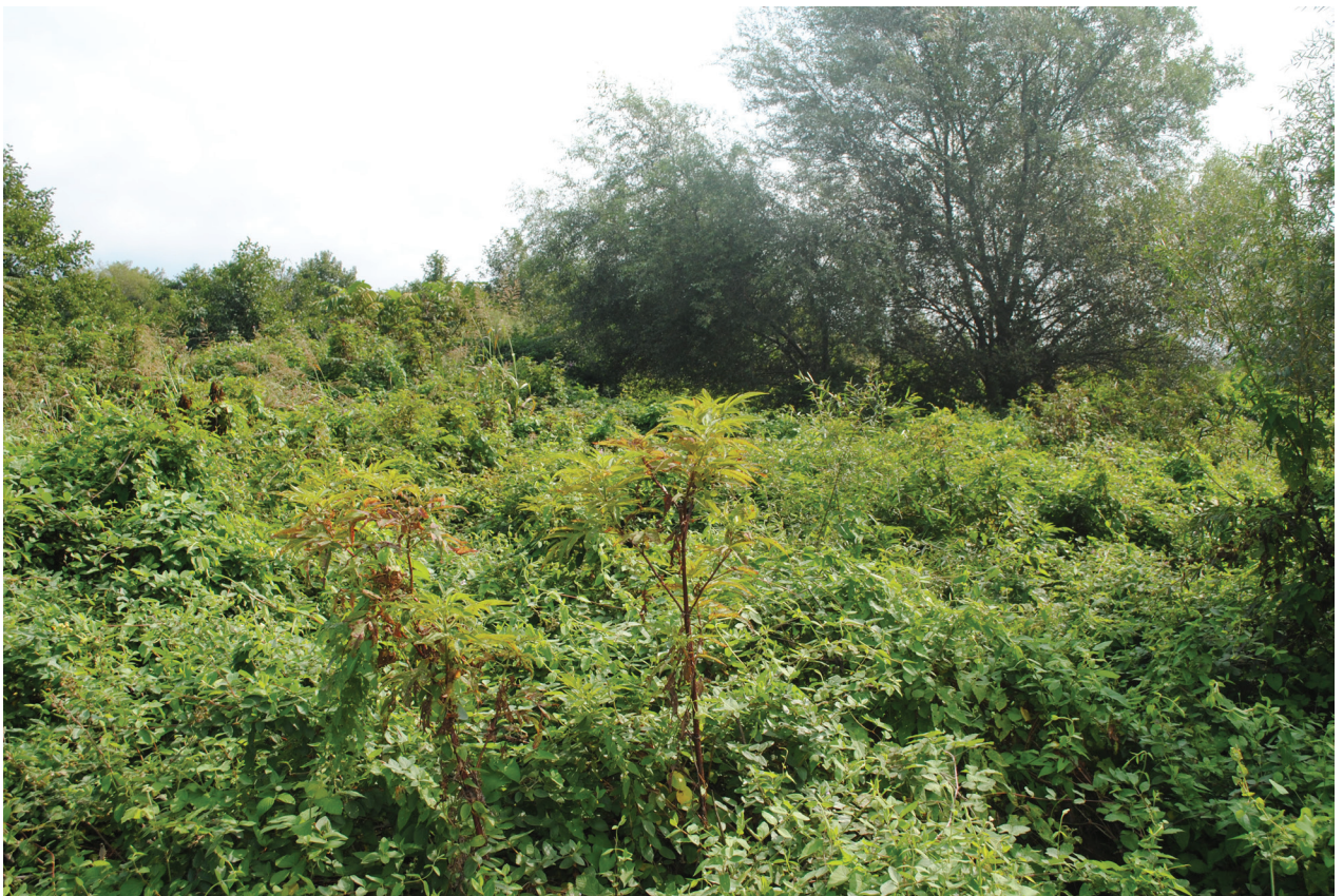
Fig. 2. Typical plant communities in the closed area of the Batumi landfill