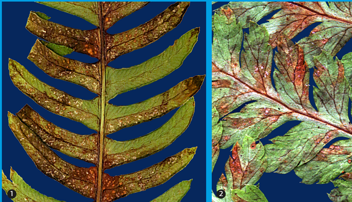
Uredinia of Milesina blechni on Blechnum spicant (1) and M. kriegeriana on Dryopteris carthusiana (2). (see pp. 46-49)

Урединії Milesina blechni на Blechnum spicant (1) і M. kriegeriana на Dryopteris carthusiana (2). (див. сс. 46-49)